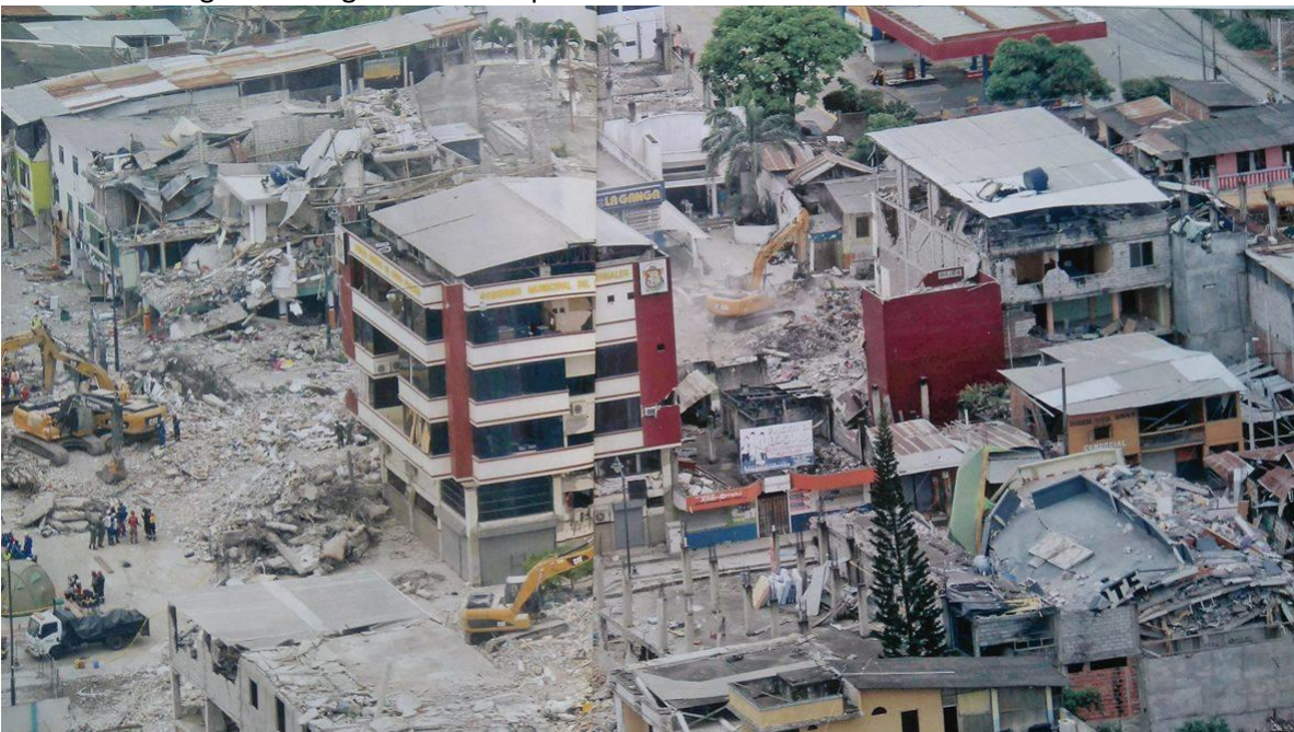
Perdenales town after the earthquake. 660 died, 113 rescued alive, 26,000 displaced (Official figures)

At the end of a busy Saturday, on the 16 th April, we were just putting our girls to bed, when the house started shaking... and didn't stop. We grabbed the girls and ran outside into an open area. We stood, clinging to each other – Tamara was trembling and Emily crying. We felt utterly helpless as we watched our house pound up and down, felt the earth moving beneath our feet, and listened to things smashing inside in the pitch black.