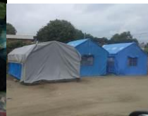
Tents for refugees