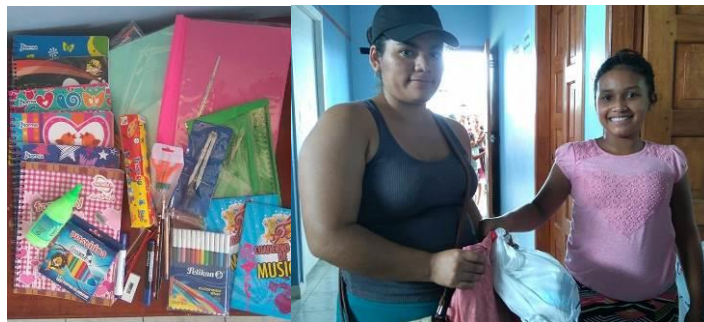
Stationary kit & receiving schoolbag

So, my time in April & May was very much taken up by responding to the earthquake and hosting and organising visitors. In addition, I gave out the help from sponsors to the 160 sponsored children. This involved first giving each child money to buy their shoes and uniform. Then, they brought me their receipts and I gave them their stationary kit (which I had previously purchased for them). The children started back at school at the beginning of May. There were several children who had moved away this year because of a lack of work here in the countryside (reflecting the general rise in unemployment and rise in the cost of living in the whole country). I found replacements for these children, so that more children continue to benefit from sponsorship and the chance to go to school.